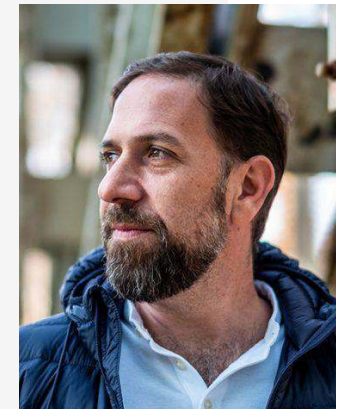
Tamás Kádár Sziget Festival

Booking Ukrainian artists and supporting fundraising for Music Saves Ukraine at events like Sziget Festival is crucial because music has the power to heal, unite, and inspire hope in times of crisis. By contributing to this cause, we are not just helping a country in need, but also sending a powerful message of solidarity and compassion to the world. Music transcends language barriers and connects us on a deep emotional level, reminding us of our shared humanity. In these challenging times, coming together through music and art helps us to spread awareness, foster empathy, and make a tangible difference in the lives of those affected by hardships. Joining hands to support Music Saves Ukraine at Sziget Festival, The Island of Freedom is not just charity – it is a meaningful expression of love, support, and solidarity towards our global community.