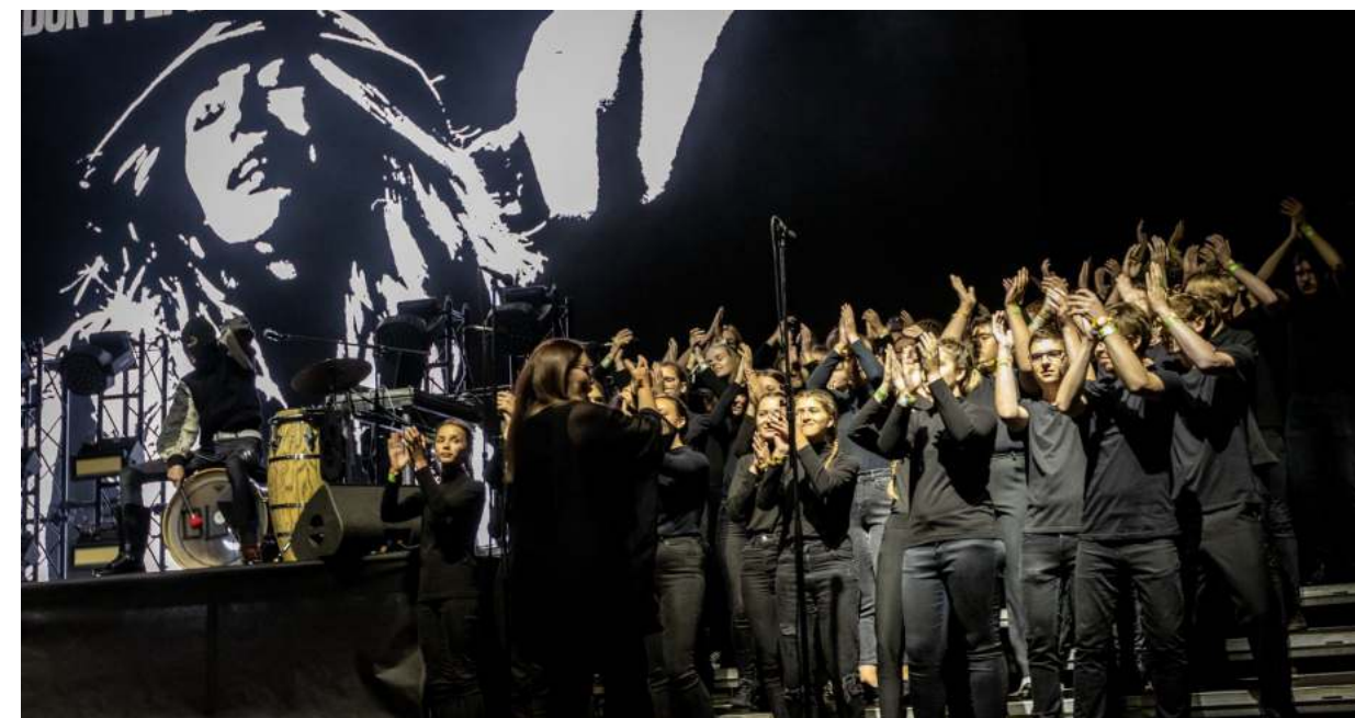
Photos: Colours Of Ostrava Balaklava Blues' performance in 2022