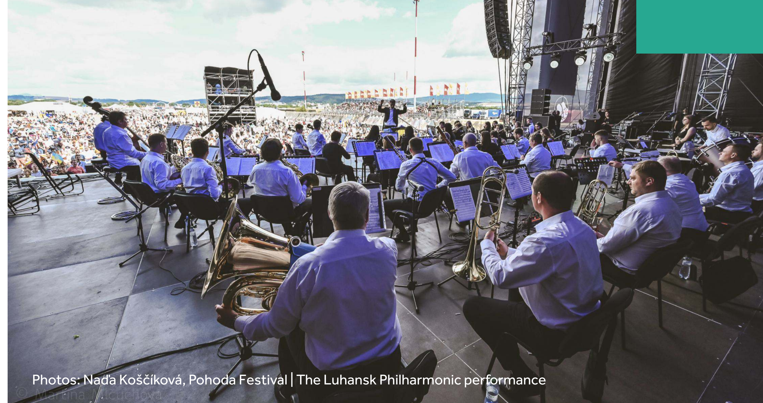
The Luhansk Philharmonic performance